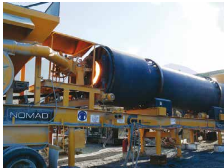
Nomad 1 mobile plant