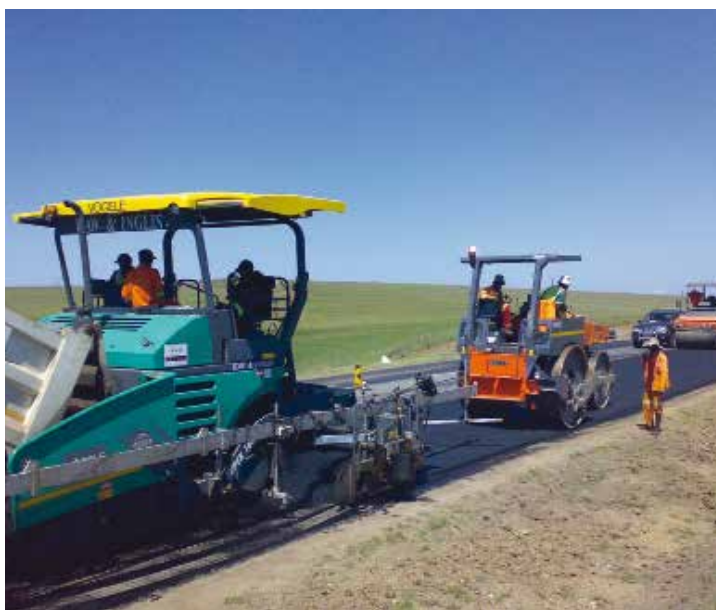
N2 Mthatha, Eastern Cape

Much Asphalt's HMA products are supplied from static asphalt mixing plants in all South Africa's major centres as well as from several mobile plants designed to supply quality product to remote projects.