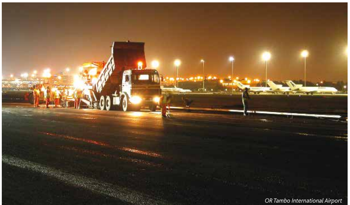
OR Tambo International Airport