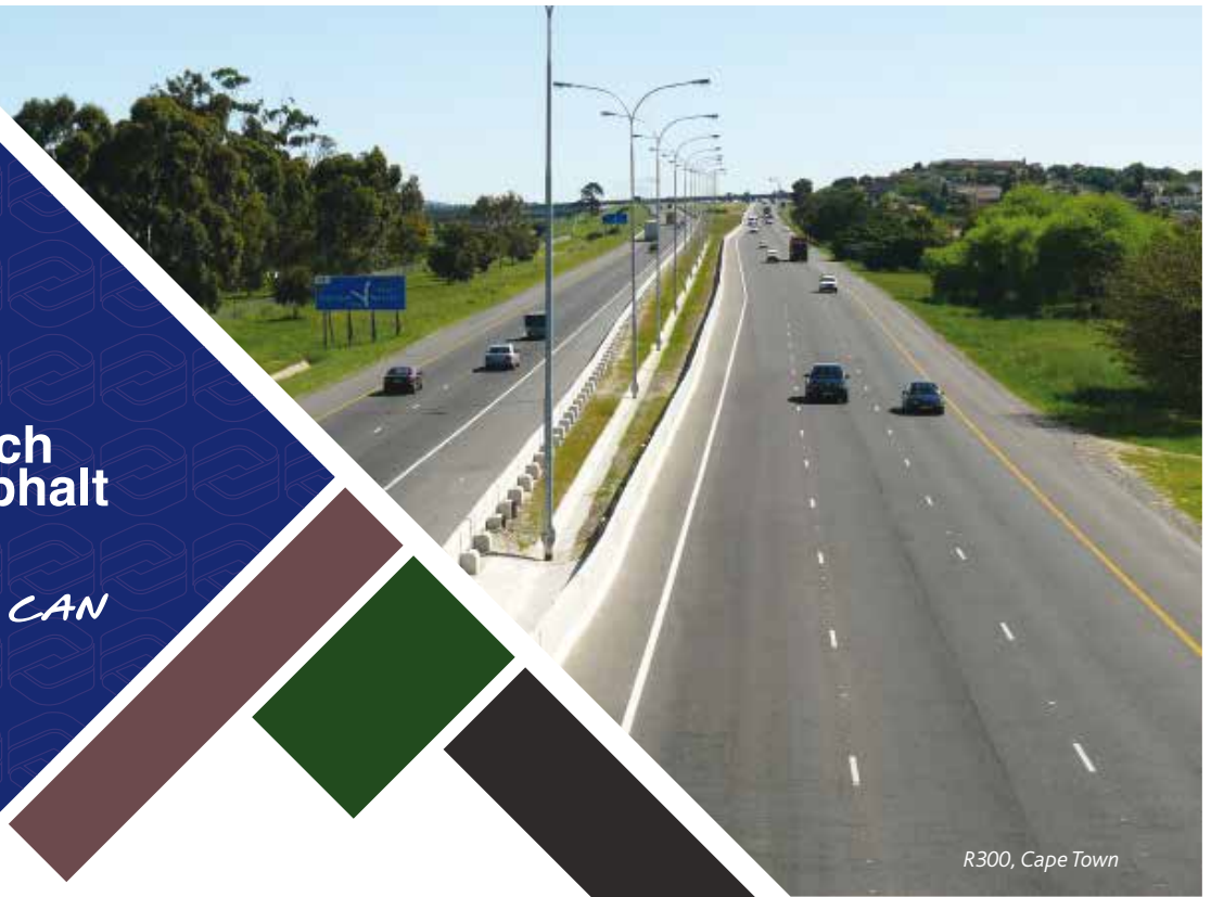
R300, Cape Town

Hot mix asphalt (HMA) comprises aggregate, bitumen and mineral filler in different proportions depending on the application. HMA is mixed and paved at high temperatures in order to achieve the required compaction.