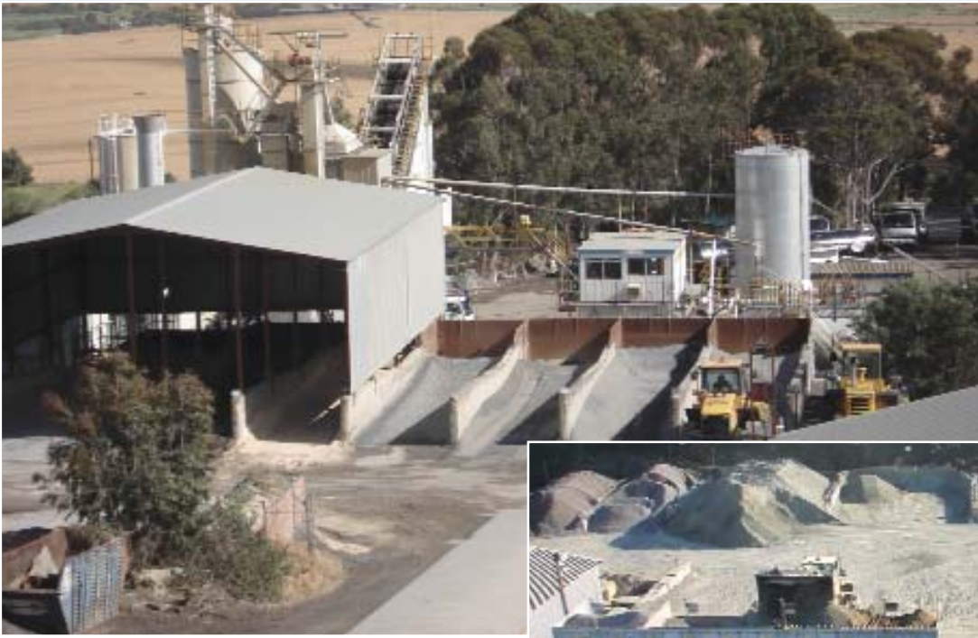
Above: Much Asphalt's Contermanskloof (Western Cape) plant was upgraded to include increased RA content on the N1 contract.