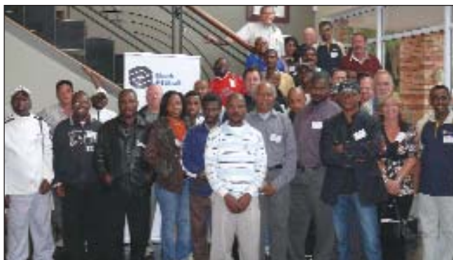
Delegates at the Hand Applicators Forum in Durban on 8 June

Much Asphalt also provides practical workshops on asphalt application by hand.