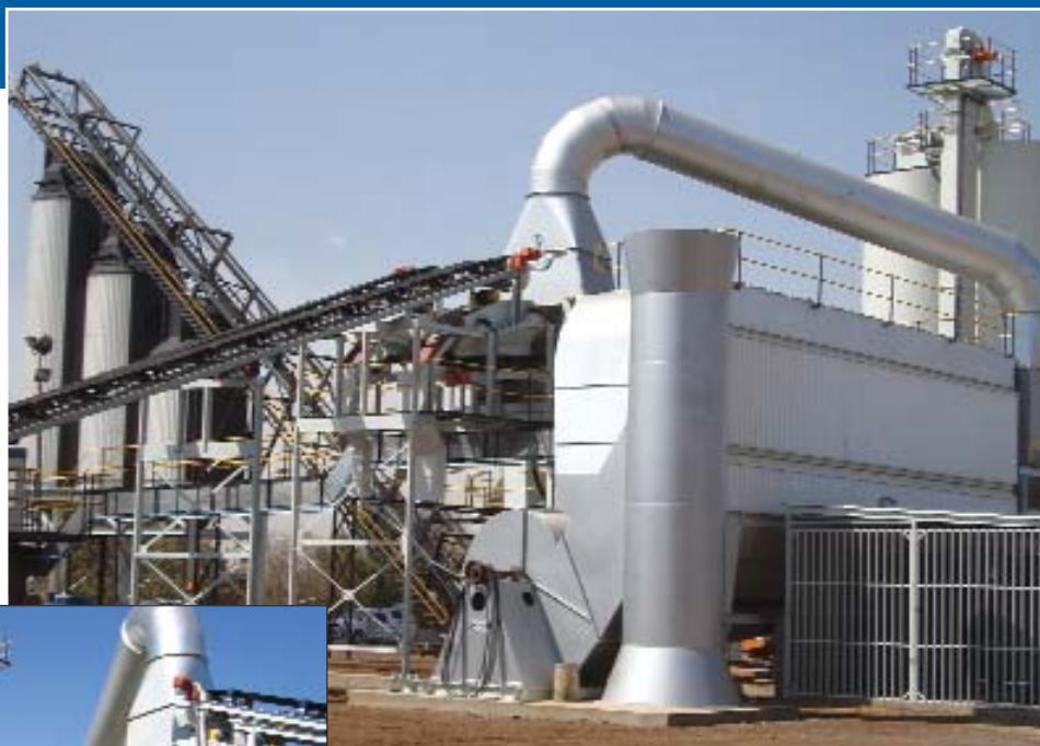
Above: View of the plant with baghouse and generator room in the foreground and hot storage in the background.