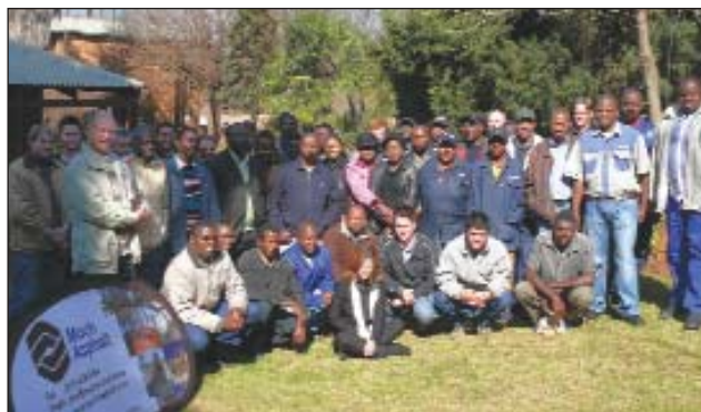
... and in Johannesburg on 7 July.