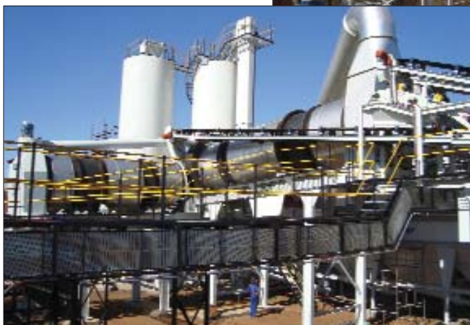
Left: Looking from the cabin towards the twin drum configuration.