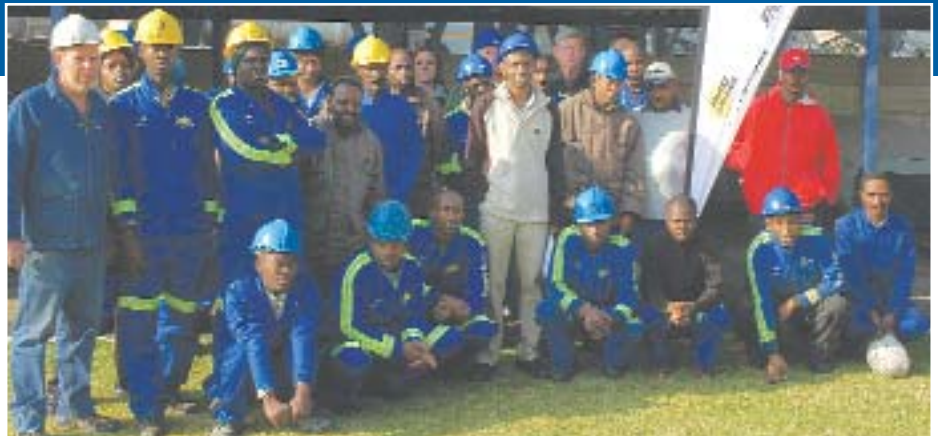
Above: Benoni branch staff.

If our workers are healthy and safe, and they undertake quality work through the value chain (administration, quality control, maintenance and operations), we will achieve our production targets.