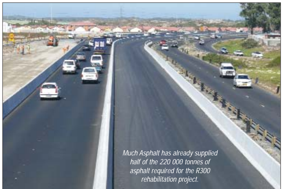
Much Asphalt has already supplied half of the 220 000 tonnes of asphalt required for the R300 rehabilitation project.

Both the BTB and wearing course are produced using an EVA-modified bitumen, which Much Asphalt acquires from Colas. This product is manufactured using 60/70