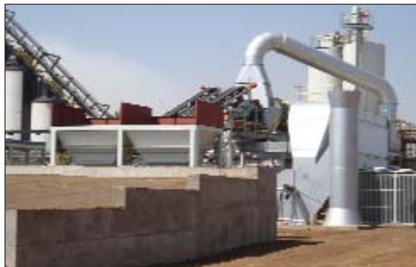
Below: The plant from the stockpile area, with the cold feed in the foreground.

The offices and laboratory have been upgraded in tandem with the erection of the new plant.