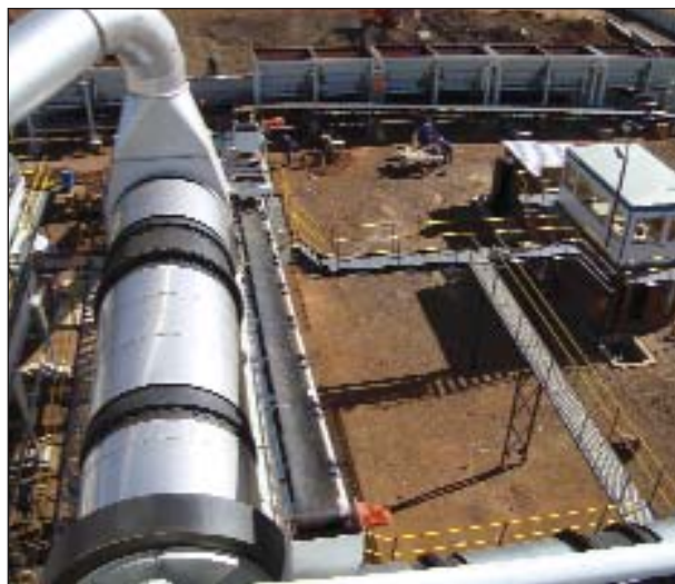
Above: View from filler silo to cold feed bins.

The new twin drum plant at Much Asphalt's Pomona facility in Kempton Park, Gauteng, was commissioned in August, adding 250 tonnes per hour to Gauteng's output.