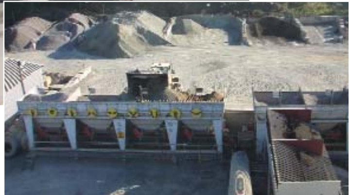
Below: The Coedmore (KZN) plant, showing RA feeding bins on the right.