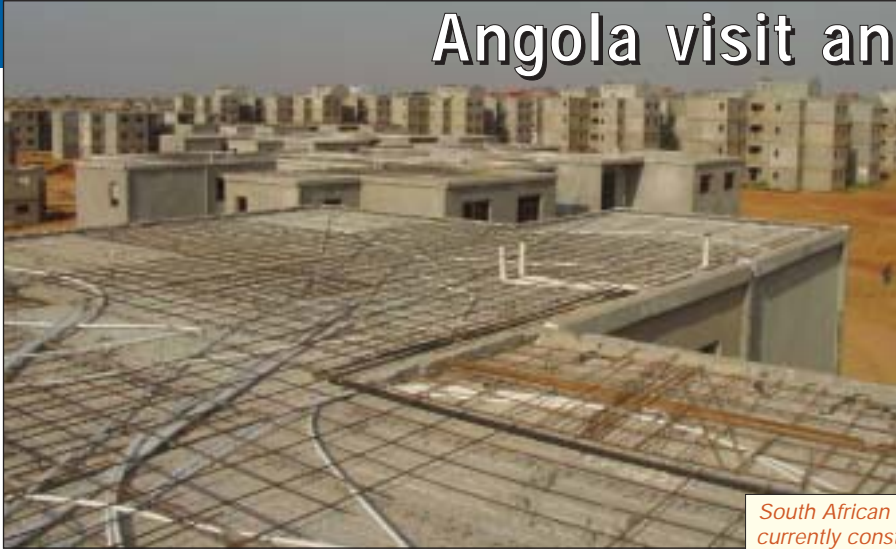
South African company Group Five is currently constructing a huge housing development just outside Luanda.

Angola is a war-torn country struggling to rebuild itself in the face of international apathy and internal chaos.