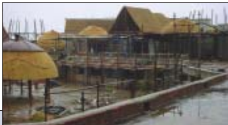
The new R700-million uShaka Marine World - formerly SeaWorld - which is expected to attract more than 1,4-million visitors when it opens its doors to the public this month.

Phambili Surfacing, working in alliance with Much Asphalt, supplied 1 000 tons of continuously medium graded asphalt for the surfacing of the project's roads.