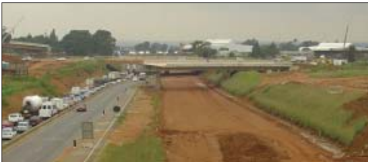
Due to heavy traffic flow, work on the Pomona interchange is being carried out during off-peak hours.

will supply about 8 000 tons of continuously graded medium asphalt. We have already supplied 5 000 tons of this for the Pomona/Petit interchange and will be supplying a further 2 000 tons of black base (BTB) and 2 400 tons of Novachip – a proprietary product - asphalt. Black Top, the surfacing contractor on site, will chip and spray the medium grade asphalt we