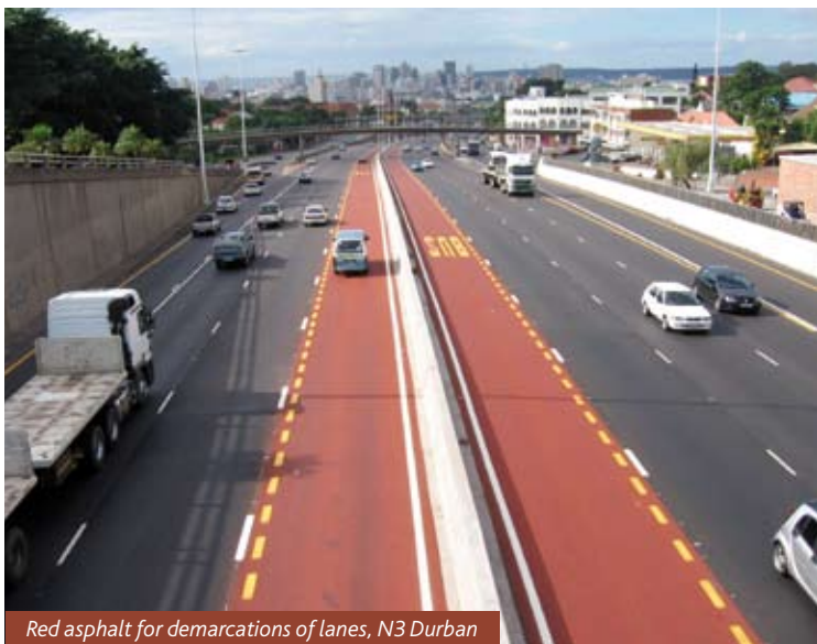
Red asphalt for demarcations of lanes, N3 Durban