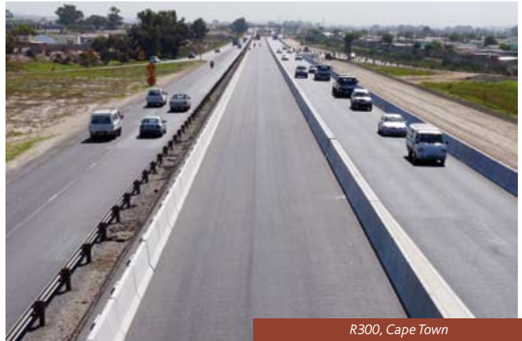
R300, Cape Town