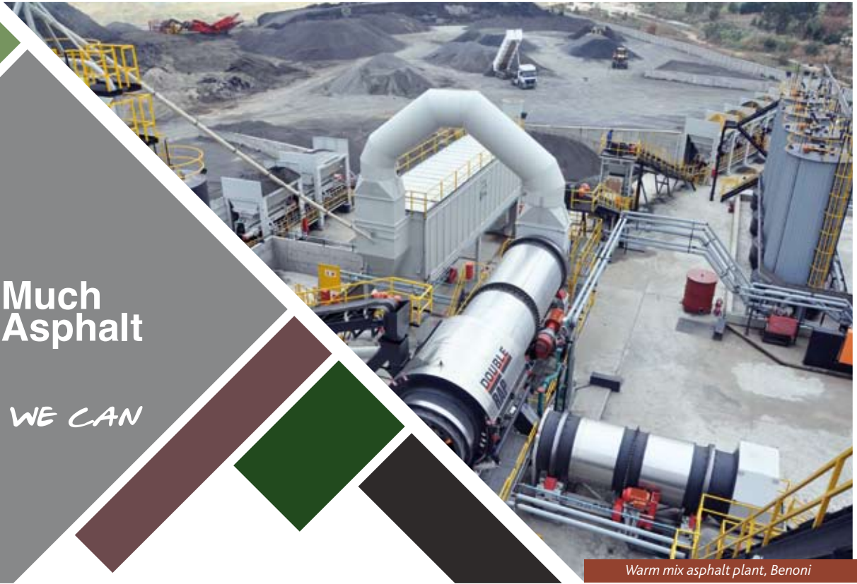
Warm mix asphalt plant, Benoni