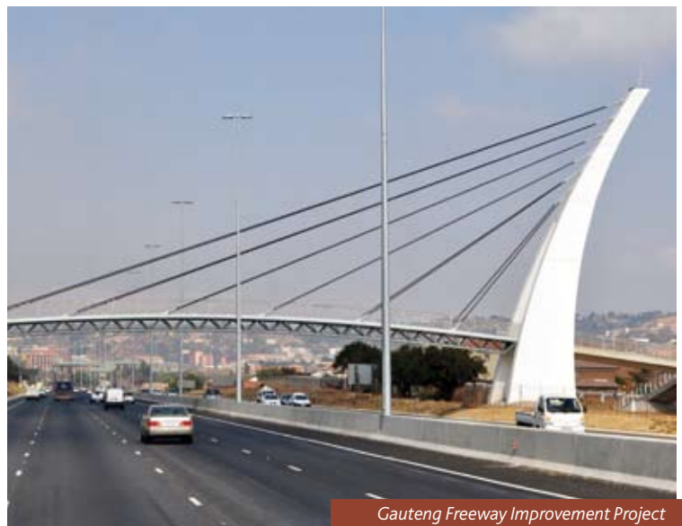
Gauteng Freeway Improvement Project